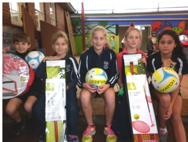
5 of our 8 lucky recipients